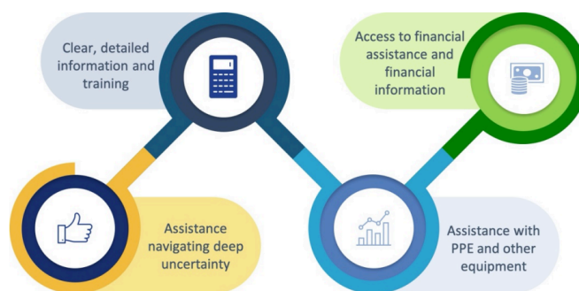
Fig. 2. Identified categories of SMEs' expressed needs.

Four categories of resources and information are identified by respondents as areas that could help them address complex event risks arising from natural disasters during the COVID-19 pandemic: 1. Assistance navigating deep uncertainty, 2. Clear, detailed information and training, 3. Assistance with personal protective equipment (PPE) and other equipment, and 4. Access to financial assistance and financial information.